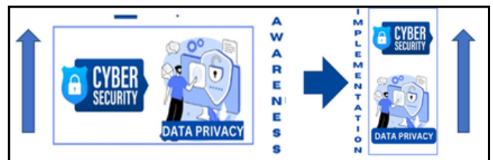
Figure 2. Result of Implementation vs Awareness.

Greater internet skills were linked to higher cybersecurity awareness