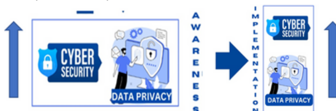
Figure 2. Result of Implementation vs Awareness.

Greater internet skills were linked to higher cybersecurity awareness