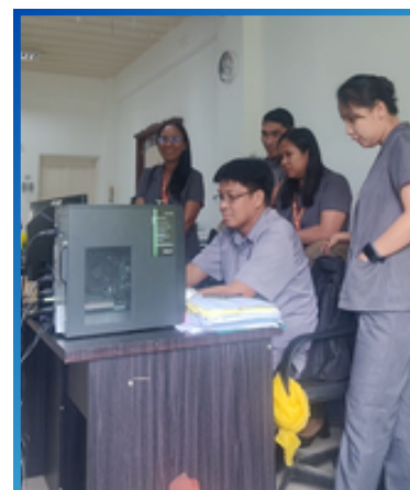
Figure 6. Coaching and Mentoring Co-employees on cyber threats.