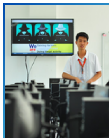
Figure 8. Mr. Cacao discusses about hacking during the seminar on Data Privacy.