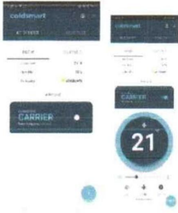
Figure 5. Control of Air-conditioners anywhere and anytime.

and other noxious gases that may harm occupant's health; and prompts through the Android Mobile App and directly on the Smart Thermostat. Shown on the left picture is the indication that the air quality inside the room is harmful and polluted with noxious gasses that are dangerous to our health. It then prompts the app to open the windows for clean ventilation.