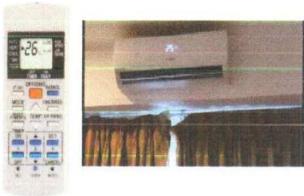
Figure 3. Everest air conditioner and Remote Control.

To save energy, it allows the occupants to choose the desired day and night temperature and operational mode based on their preferences; by cycling compressor cooling, automatic, dry, and fan-mode through specific time and day schedule Figure 3 shows the smart schedule of the mobile app. The picture on the left depicts the capability of the occupants to add and customize their preferred day and time for schedule, temperature, various commands and modes shown on the right picture.