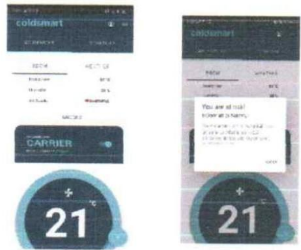
Figure 7. Air Quality mobile.