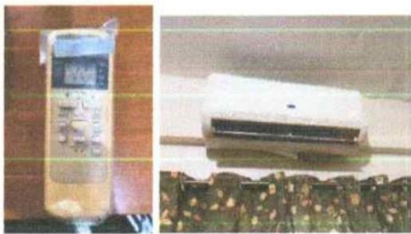
Figure 2. Carrier air conditioner and Remote Control.

Occupancy sensors track status of users and auto adjust settings for optimum comfort and energy conservation. Shown here are the data points monitored when the air conditioner is on; the red line indicates the room temperature; blue for the outside temperature forecast from the app, maroon for the actual room humidity from the 10T; green for outside forecast humidity, black for motion of occupants, yellow (PM2.5) and pink (PM10) values for indoor air quality index, black for the movement of occupants, gold for aircon mode (like compressor, auto, dry and fan-mode) with different time schedules on a calendar day, refer in Fig 1.