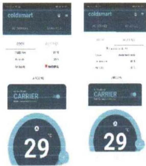
Figure 6. Weather Tracking mobile apps.