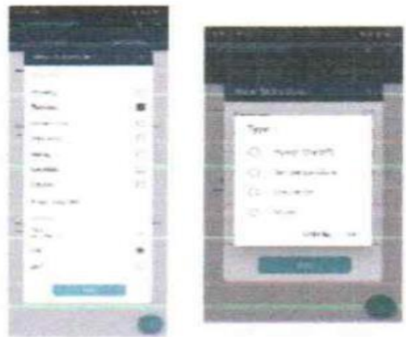
Figure 4. Smart Schedule of Mobile App.

Programming Interface (APT) from Open Weather Map and utilize (1) temperature and